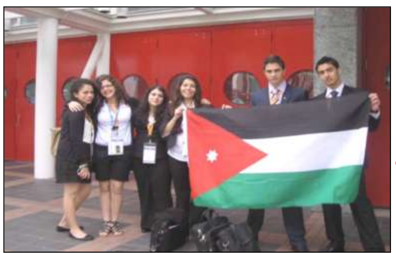
Copyright 2 001 Vs1.20 © ICME