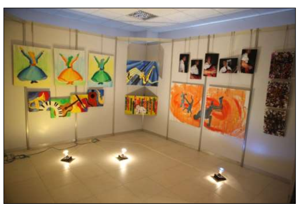
Copyright 2 001 Vs1.20 © ICME