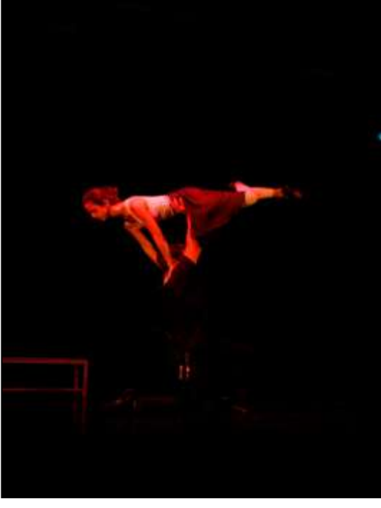
Copyright 2 001 Vs1.20 © ICME